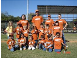
2008 NAO Shetland Longhorns