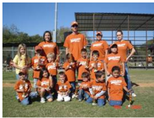
2008 NAO Shetland Longhorns